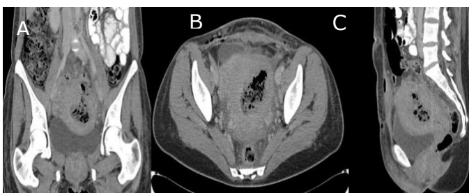
Hypodense area with air formation compatible with the abscess appears in the fibroid localization within the uterus. A. Coronal section B. Horizontal section C. Sagittal section

In the location of the fibroid, 6 cms hypodense area included irregular air formation was detected consistent with abscess (Figure 2).